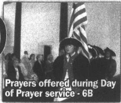
Prayers offered during Day of Prayer service - 6B