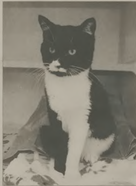
Azuki is quite the charmer that is full of fun. He is a young male Tuxedo cat. Azuki's adoption fee includes neutering, basic shots and a micro chip.