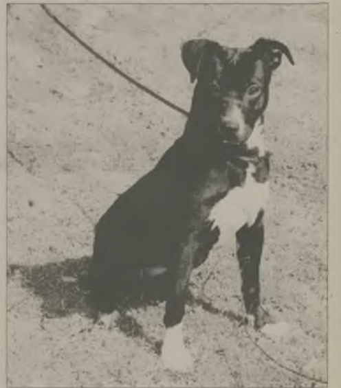
Sweet little Olivia is a young female mixed breed. She just admires people and loves being near people at all times. She pictures herself as a lapdog, already walks fairly well on a leash, and shows much potential for learning many commands.

The Tri-County Animal Shelter and Adoption Center is on Icaria Road in Tyner and can be reached at 221-8514.