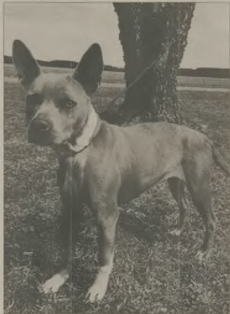
Adorable Laya is a young female mixed breed with seriously big ears and golden eyes. Laya is also a great tail wagger and sweet talker.