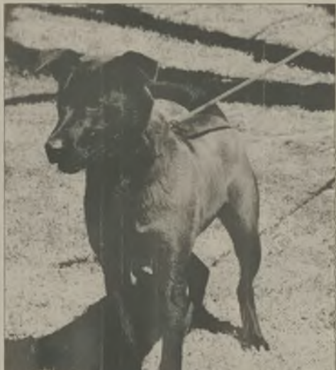
Young Cooper's coat is a series of dark rich coffee colors. Cooper, a Lab mix, is full of energy and smartness. He is ready to learn and please a new human partner.