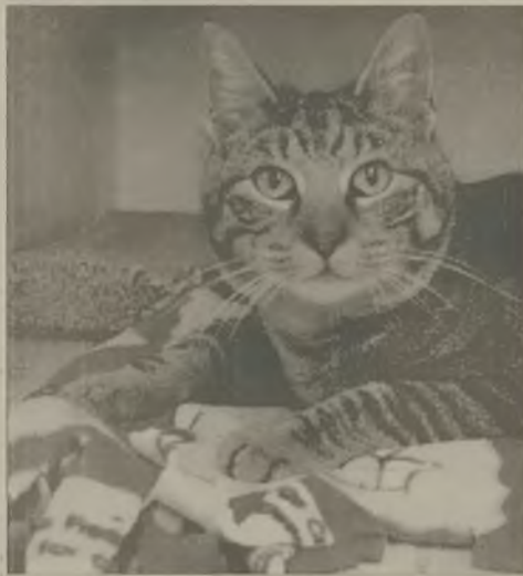
Striped Dozer is a young male Gray Tabby that has become accustomed to lounging around waiting for visitors to admire him. He has a friendly nature and has mastered the arts of purring and flirting.