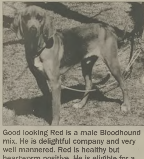
Good looking Red is a male Bloodhound mix. He is delightful company and very well mannered. Red is healthy but heartworm positive. He is eligible for a Healthy Heart Scholarship from AWARE, which will pay a portion of the cost of his heartworm treatments. Scholarship details are available by contacting the Tri-County Animal Shelter on Icaria Road in Tyner by calling 221-8514.