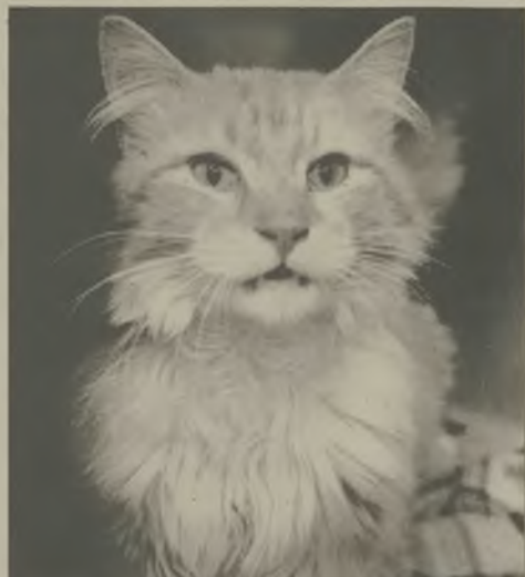
Long-haired Carrot Top, a male Orange Tabby is full of personality. Carrot Top is accomplished at communicating through various meows.

The Tri-County Animal Shelter and Adoption Center is on Icaria Road in Tyner and can be reached at 221-8514.