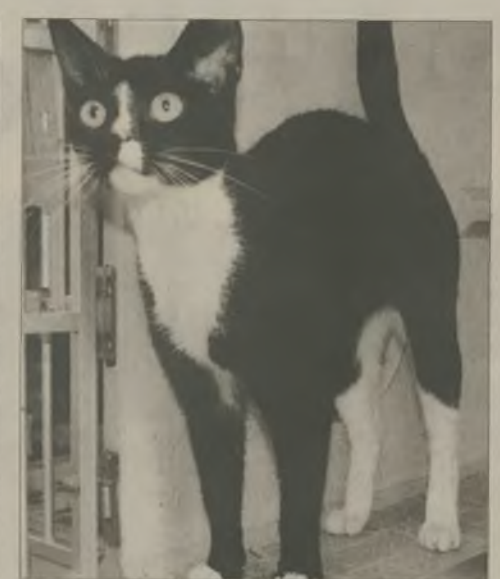
Young and beautiful Socks with the large golden eyes is a Tuxedo cat. Socks is a sweet, calm, easygoing girl that is a pleasure to have around. The Tri-County Animal Shelter and Adoption Center is on Icaria Road in Tyner and can be reached at 221-8514.