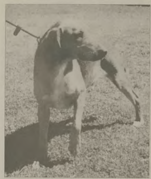
Scout is a sweet and gentle adult male Tri-color Hound mix. His easy going nature makes him a delight to be around.