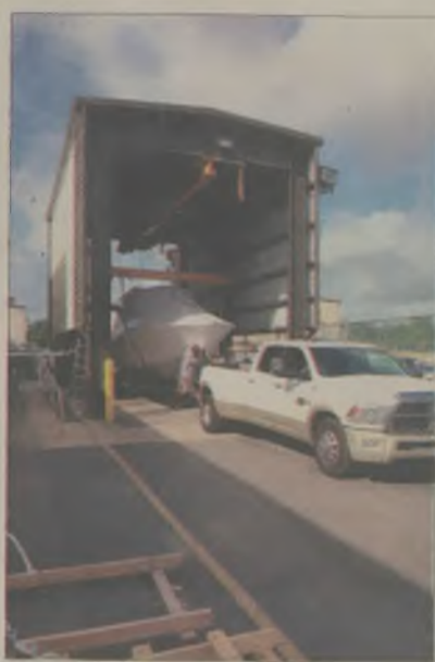
A boat is lowered onto a trailer for shipment to a dealer. Regulator Marine produces four boats per week.