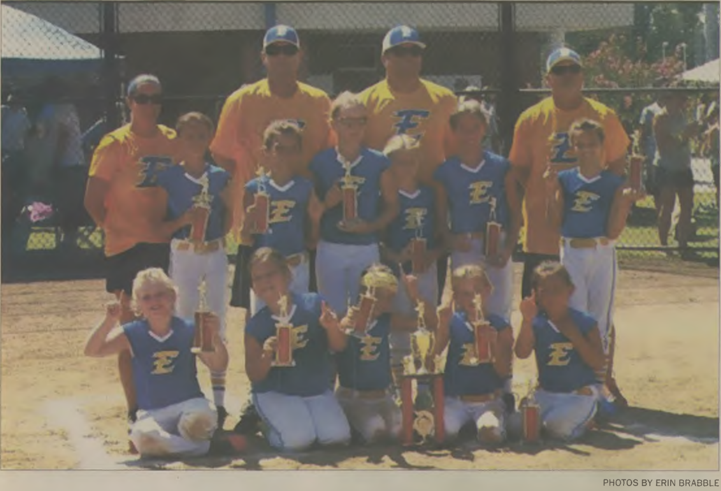
Edenton's Little League softball team joins the winner's circle of teams from Chowan County who have gone the distance by