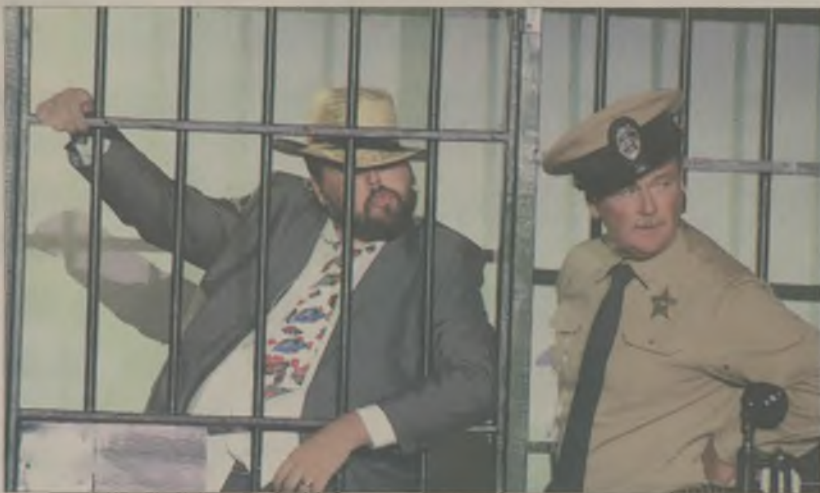
Alright Otis. Get in the jail cell. Sleep it off. Maybe if you're lucky, you won't wake up next to a goat who ate a bunch of dynamite. Kablooy!