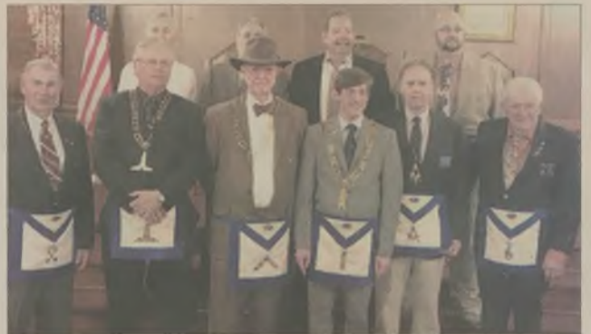
Masons celebrate courthouse anniversary — 3B