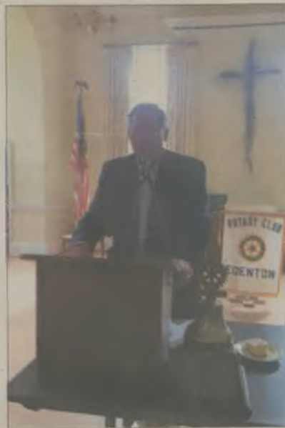
U.S. Senator Richard Burr talked about tax reform, fake news and President Trump during his recent visit to the Rotary Club of Edenton.

"I believe America should do everything they can to restore older properties," Burr said. "The challenge is that