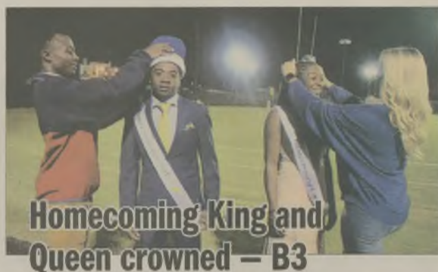
Homecoming King and Queen crowned — B3