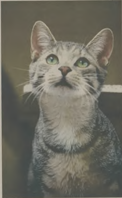
Poised and pretty, Ashley a young adult female Tabby mix is pondering where she will land next. Hopefully it will be in a wonderful loving home.