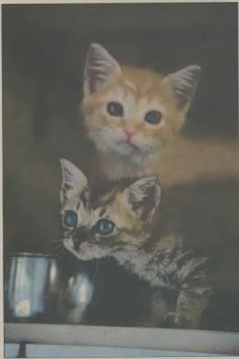
Sage is a little Tabby kitty with big blue soulful eyes and her sister Carrot is an Orange Tabby. The darling girls also have a cream Tabby brother Basil who is just as cute as they are. All three kittens are full of love and fun.