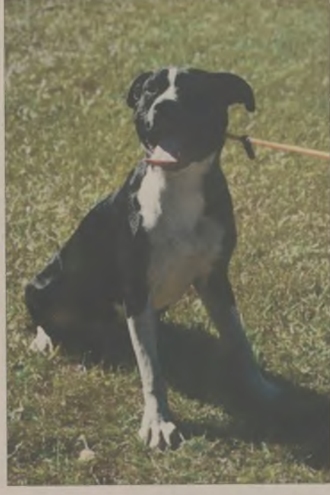
Happy go lucky Dice, a Bullie mix, is just one year old. He is an extremely happy dog that greets people with a wagging tail and a big smile. Delightful Dice is also well mannered.