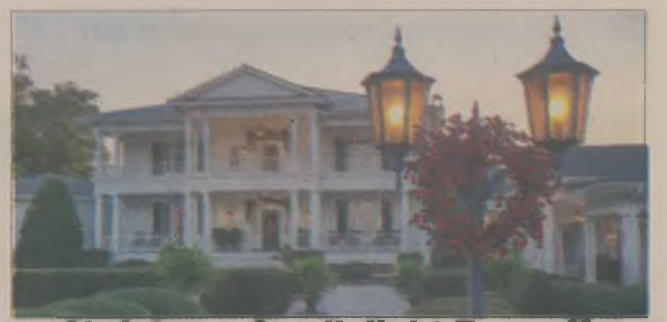
Christmas Candlelight Tour offers feast for senses – B1

PB/CB*****CAR-RT LOT**C 002 A0038 SHEPHERD PRUDEN LIBRARY 106 W WATER ST EDENTON NC 27932-1854