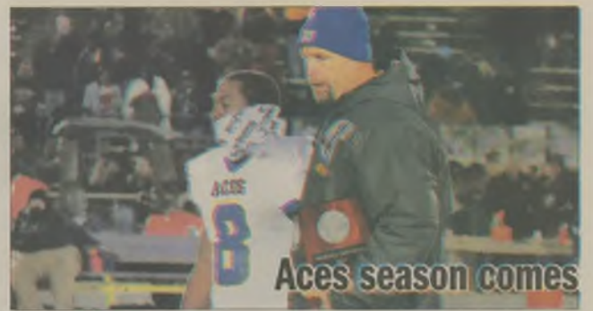
Aces season comes to an end — B1

PB/CB*****CAR-RT LOT**C 002 A0038 SHEPHERD PRUDEN LIBRARY 106 W WATER ST EDENTON NC 27932-1854