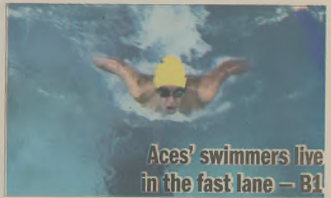
Aces' swimmers live in the fast lane — B1