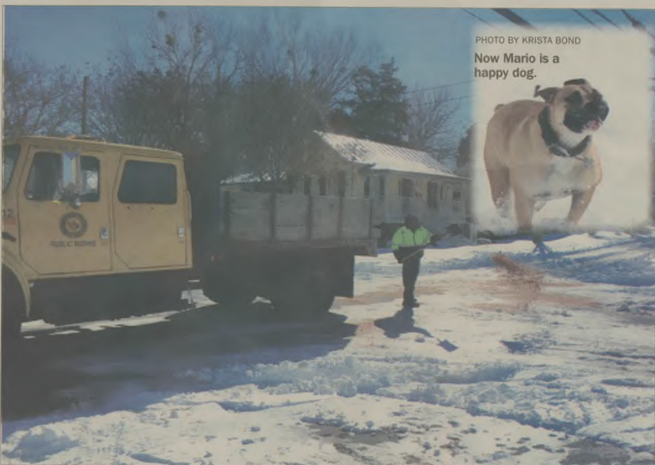
Now Mario is a happy dog.