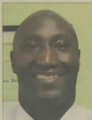
See KING, 2A