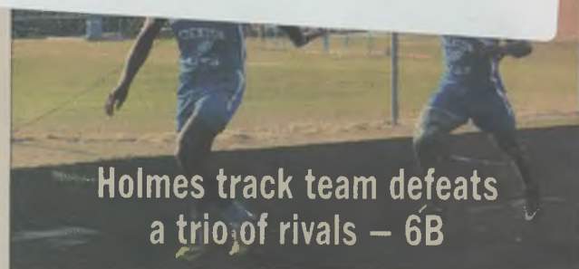
Holmes track team defeats a trio of rivals — 6B