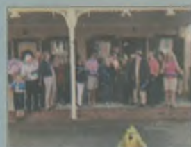
Sugar Bears opens

A National Day of Prayer observance will take place in Edenton at the historic 1767 Chowan County Courthouse on May 3 starting at noon. — 5B