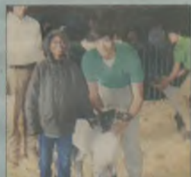
County holds 4H show

Sugar Bears, at 110 E. King St., celebrated its grand opening Thursday evening with a ribbon cutting and a chance to let visitors take a peek inside the store that is a feast for the eyes and the sweet tooth. — 4A