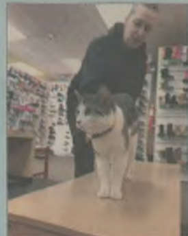
Store has adoption day