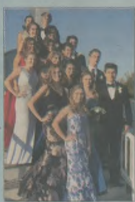
Prom creates memories

Memories that last a lifetime were created Saturday at the John A. Holmes High School Prom. — 3B