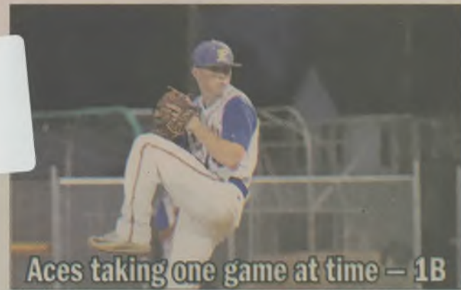
Aces taking one game at time — 1B

P8/CE*****CAR-RT LOT**C 002 A0038 SHEPHERD PRUDEN LIBRARY 106 W WATER ST EDENTON NC 27932-1854