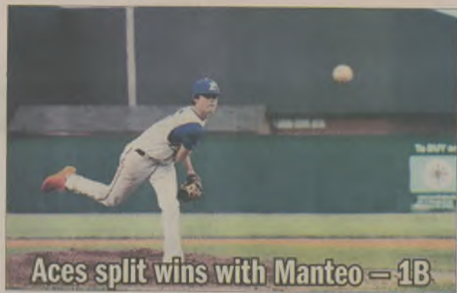
Aces split wins with Manteo — 1B