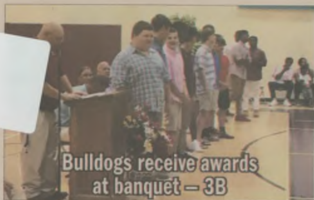
Bulldogs receive awards at banquet — 3B