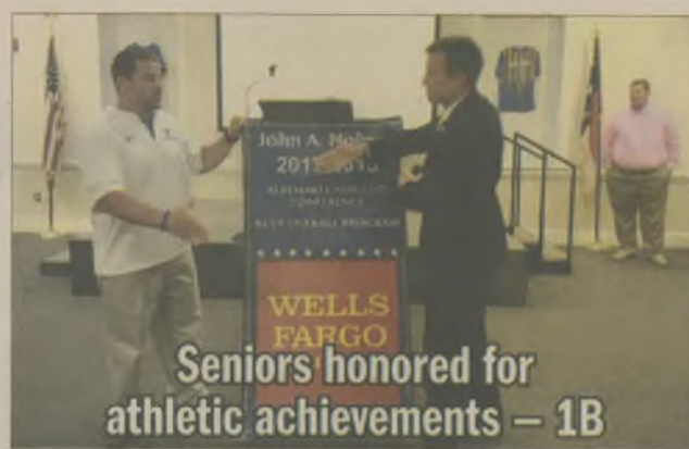
Seniors honored for athletic achievements — 1B