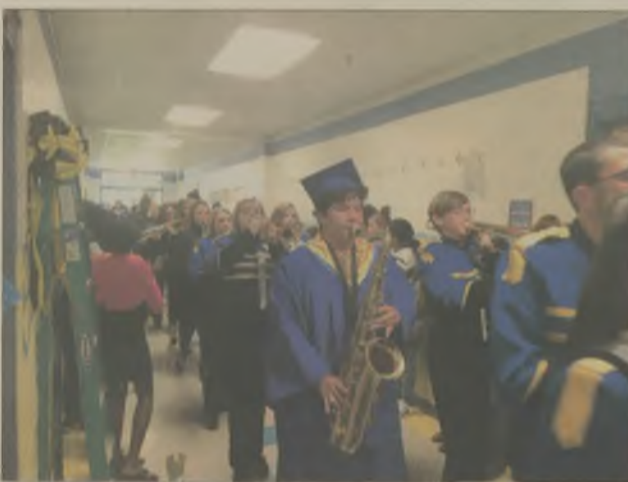
Aces band leaves memories wherever it goes.

Saturday, these Aces will turn their tassels, throw their caps in the air and be transformed into alumni. Though commencement starts at 7 p.m. at the foot-