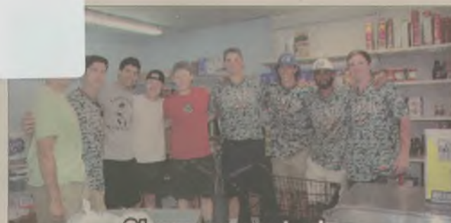
Steamers post win against trio of teams — 2B