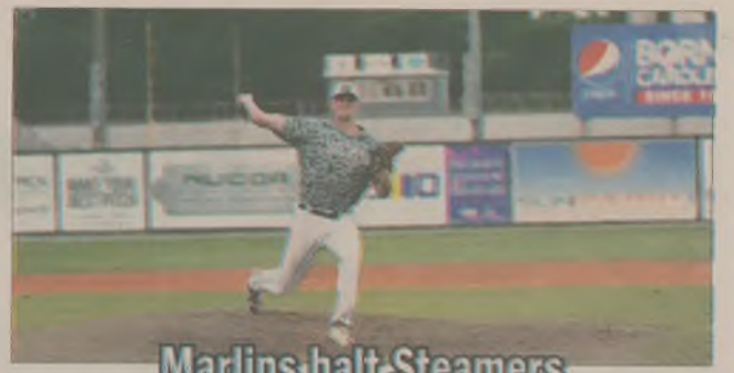
Marlins halt Steamers bat three-game streak — 4B