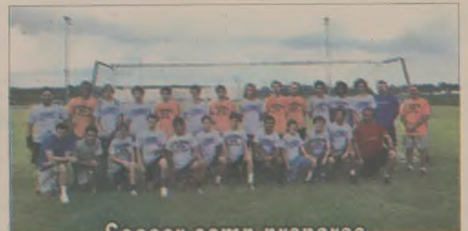
Soccer camp prepares Aces' warriors — 1B