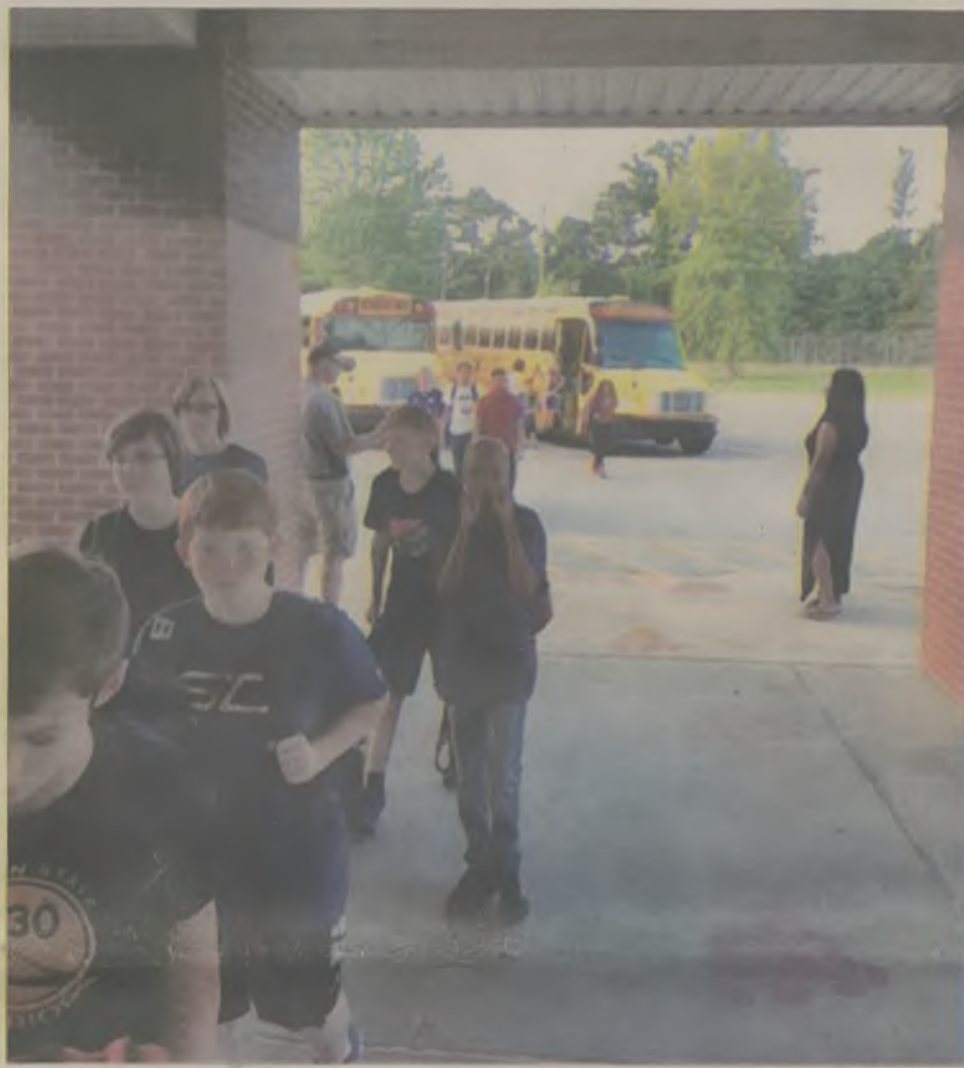
Summer vacation is over for these students returning to classes Monday at Edenton-Chowan schools.

"We are elated to have our Hornets back in the hive and know this will be an amazing year," she said. "D.F. Walker's theme this year is 'Anchored in Excellence! Reaching every single one in the deep blue sea! We will continue our tradition of academic excellence by promoting a positive school culture