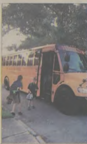
School has started, so there will be no more morning beach trips or days spent chasing colors in video games!

where every child is inspired to reach their maximum potential. We truly believe that this year we will reach unprecedented success."