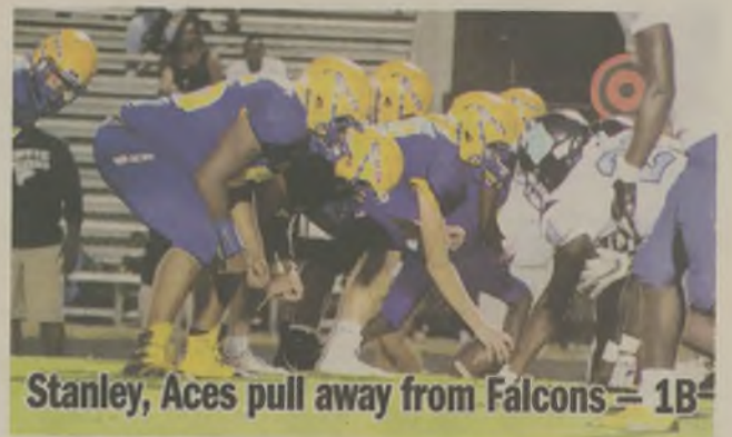
Stanley, Aces pull away from Falcons — 1B