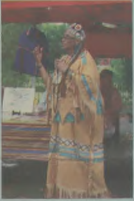
Fest showcases history

Moms, dads and kids of all ages crowded Broad Street on Saturday morning to enjoy watching the 43rd annual Peanut Festival Parade. — 6A