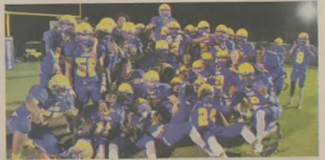
Aces cruise to win over Red Barons — 1B

SHEPHERD PRUDEN LIBRARY 106 W WATER ST EDENTON NC 27932-1854