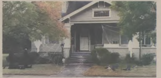
Happy Halloween — 8B

P11/C8*****CAR-RT LOT**C 002 A0038 SHEPHERD PRUDEN LIBRARY 106 W WATER ST EDENTON NC 27932-1854