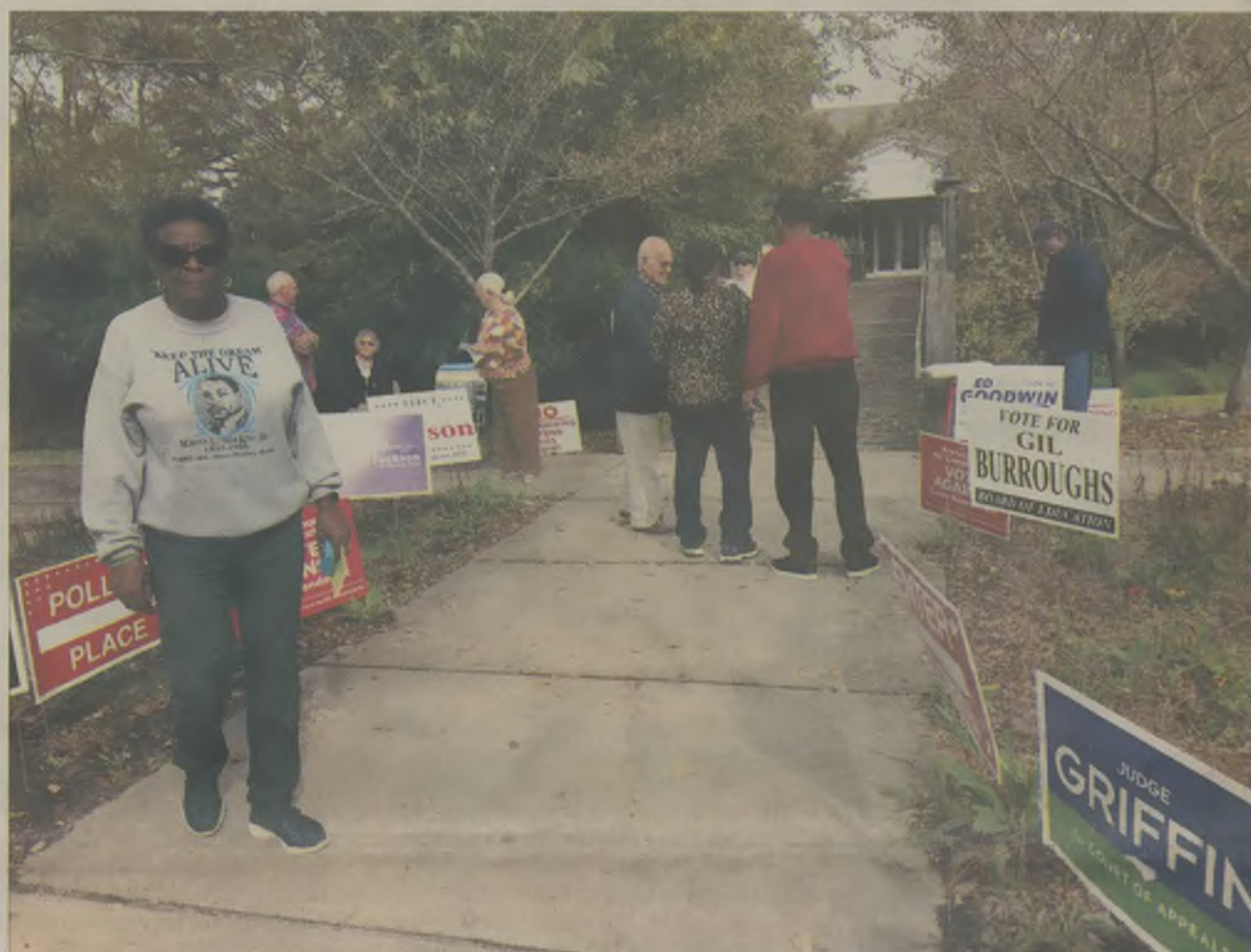
NICOLE BOWMAN-LAYTON/CHOWAN HERALD

©2018 The Chowan Herald All Rights Reserved