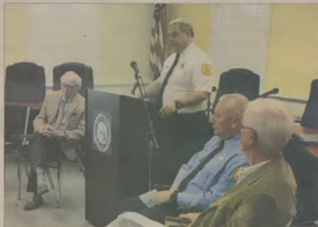
NICOLE BOWMAN-LAYTON/CHOWAN HERALD