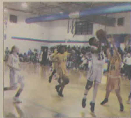
Teams end regular season with wins — 1B

P14/C8*****CAR-RT LOT**C 002 A0038 SHEPHERD PRUDEN LIBRARY 106 W WATER ST EDENTON NC 27932-1854