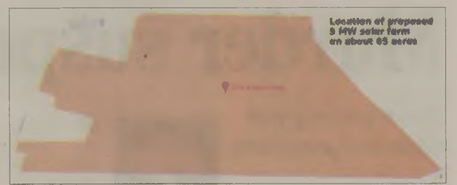
Location of proposed 5 MW solar farm on about 65 acres

Another condition commissioners sought was moving the fence line from the property's borders closer to the affected development so as to provide more of a buffer between Virginia Road