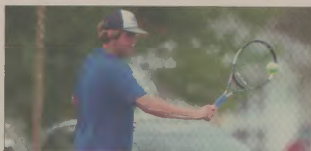
BOYS' TENNIS TEAM TO HOST KIPP PRIDE IN PLAYOFFS - PAGE B1