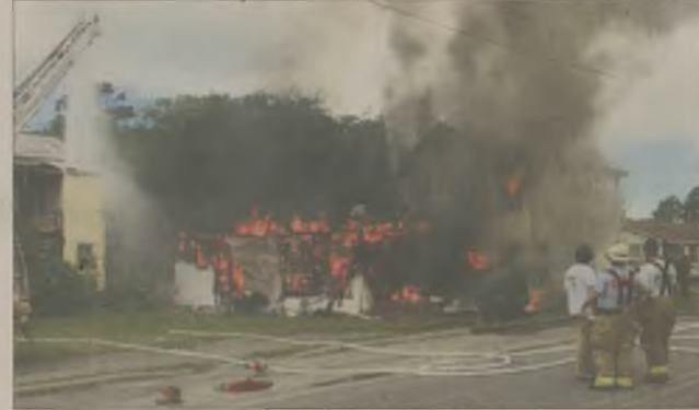
Edenton firefighters watch a controlled burn at two vacant houses Saturday in the 200 block of North Oakum Street. To the left, the ladder truck is spraying water on a home on East Gale Street to prevent it from catching on fire.