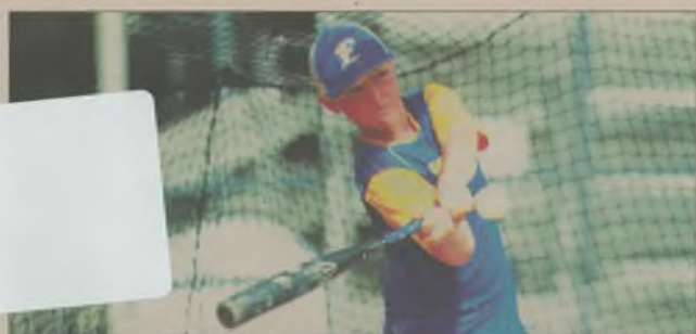
EDENTON STEAMERS HOST JUNIOR HOME RUN DERBY — B4

P9/C8*****CAR-RT LOT**C 002 A0038 SHEPHERD PRUDEN LIBRARY 106 W WATER ST EDENTON NC 27932-1854