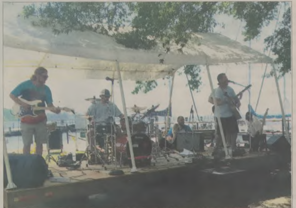
Drunken Confessions performs Saturday during Edenton Music and Water Festival.

that the weather had a hand in making the Music and Water Festival a great success.