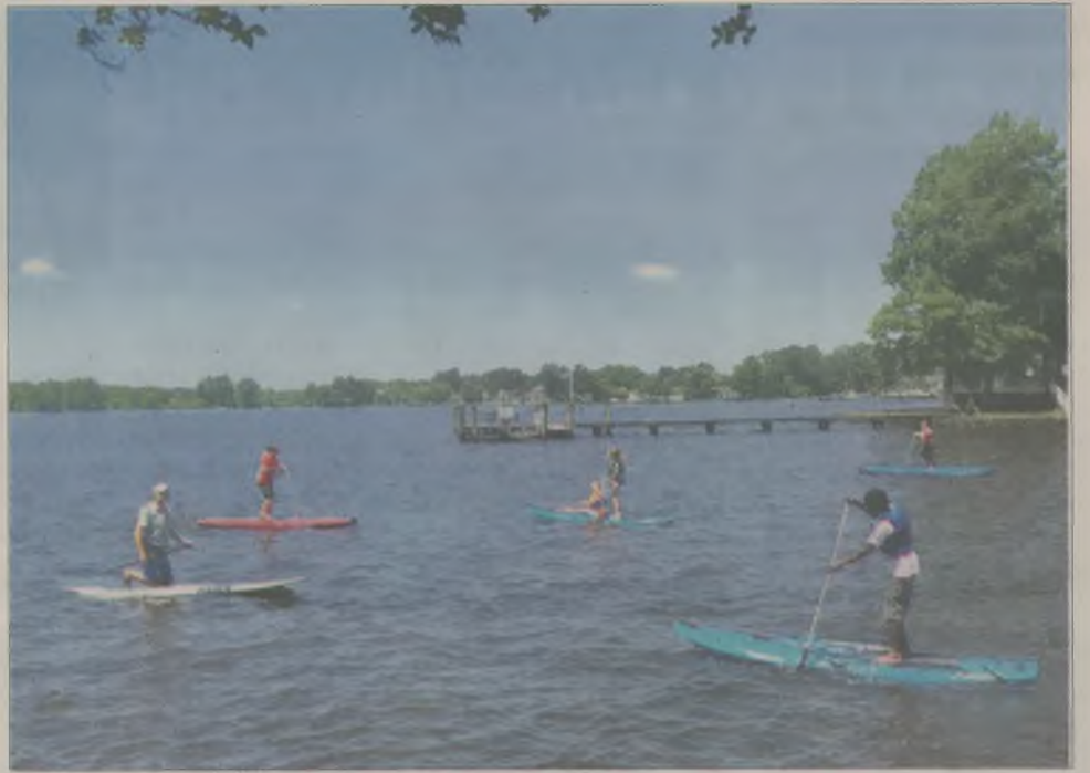
People try out paddle boards Saturday during the Edenton Music and Water Festival. The paddle boards were provided by Kitty Hawk Kites and the Edenton-Chowan Rec Department.