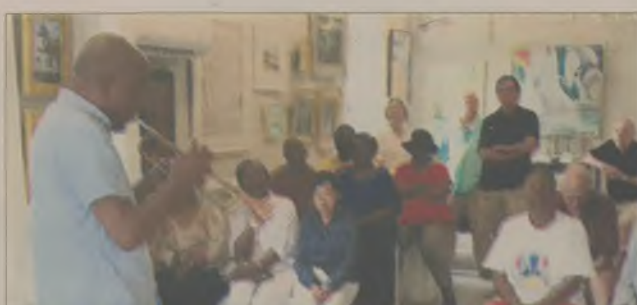
CHOWAN ARTS COUNCIL HOSTS JAZZ CONCERT — A8