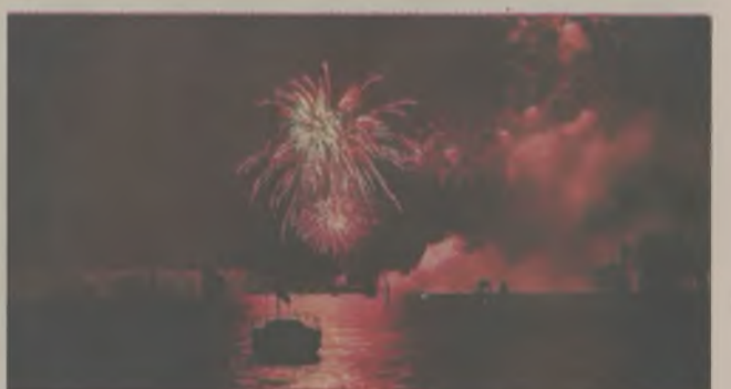
CHOWAN-EDENTON OPTIMIST CLUB

Chowan-Edenton Optimist Club has provided Fourth of July fireworks for 40 years.