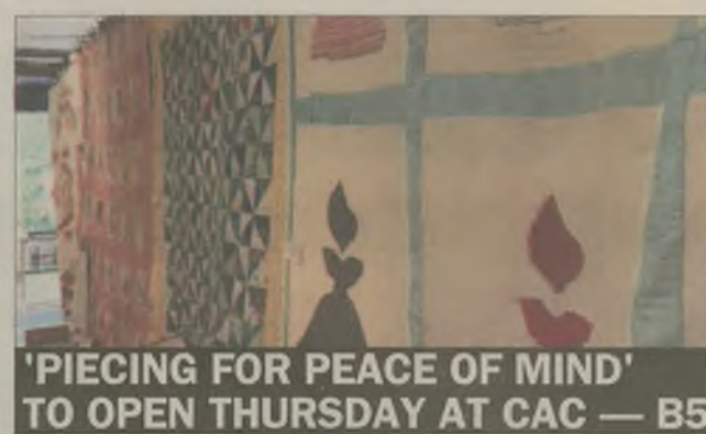
'PIECING FOR PEACE OF MIND' TO OPEN THURSDAY AT CAC — B5