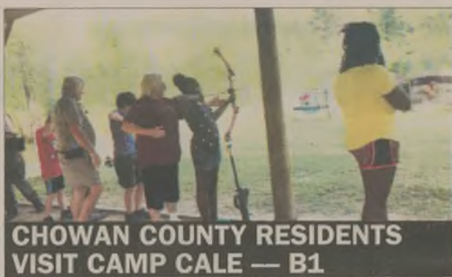
CHOWAN COUNTY RESIDENTS VISIT CAMP CALE — B1