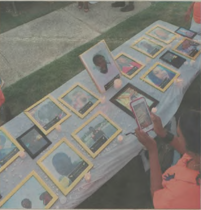
A visitor to "Sno Day" takes a picture of table decorated with candles and photos of those killed by gun violence Saturday at Colonial Park. Edenton.