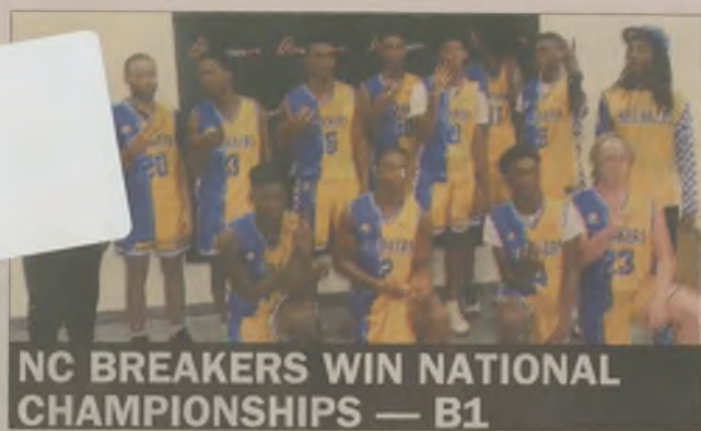
NC BREAKERS WIN NATIONAL CHAMPIONSHIPS — B1