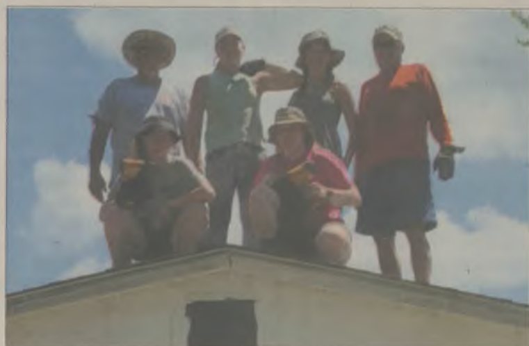
Volunteers from Christ United Methodist Church in Salisbury work on a house on Mexico Road recently as part of Carolina Re-building Ministry, based in Plymouth.