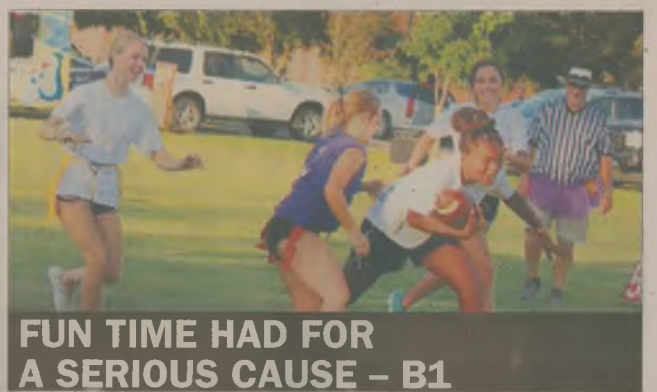
FUN TIME HAD FOR A SERIOUS CAUSE - B1