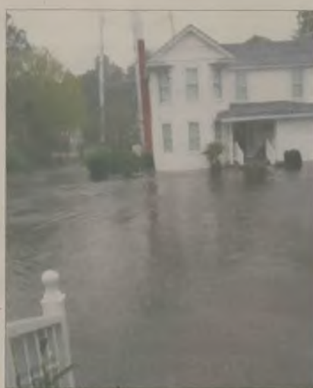
Road Street in Columbia is flooded after Hurricane Dorian.