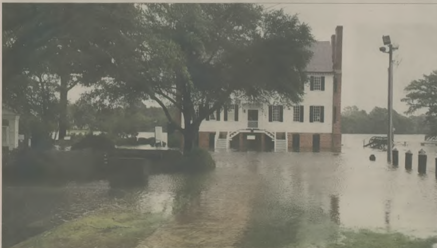
Water from Edenton Bay covers the parking lot and land surrounding the Barker House and the harbor Friday morning.