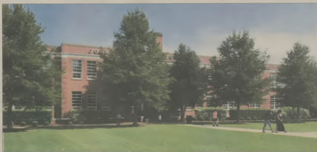
Students get out of school Monday at John A. Holmes High School.