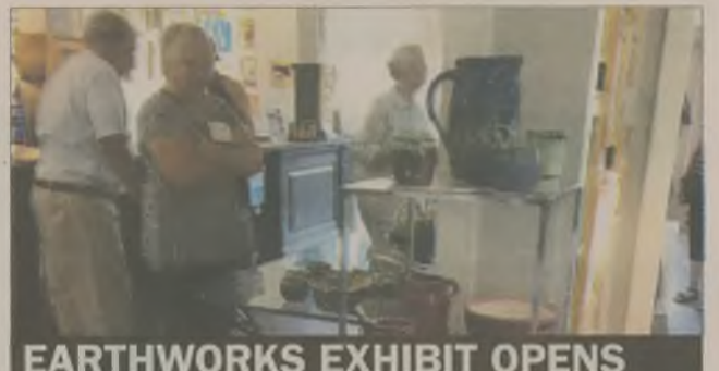
EARTHWORKS EXHIBIT OPENS AT CHOWAN ARTS COUNCIL — A8