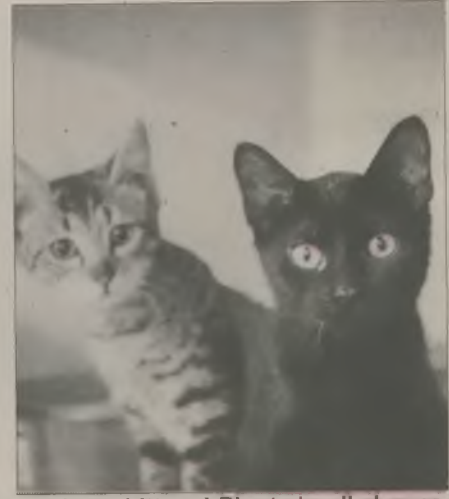
We have kittens! Plenty in all shapes, sizes and colors. Kittens can always be adopted for a BOGO price.