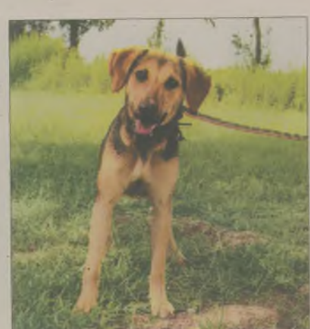
Lexie is a young girl with energy to burn. She would do best in an active home where she can be her happy puppy self.