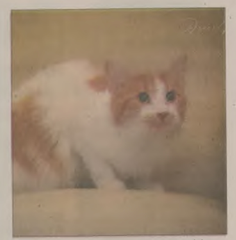
Ginger is a beautiful long hair girl who enjoys attention. One scratch of her head, and she is melting at your

The Tri-County Animal Shelter and Adoption Center is on Icaria Road in Tyner and can be reached at 221-8514.