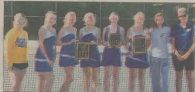
ACES GIRLS TENNIS TEAM CLAIMS AAC TITLE — B1

P12/C8*****CAR-RT LOT**C 002 A0039 SHEPHERD PRUDEN LIBRARY 106 W WATER ST EDENTON NC 27932-1854