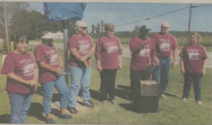
Members of the Chowan High School's Reunion Committee strike a pose next to the highway marker that pays tribute to their school.