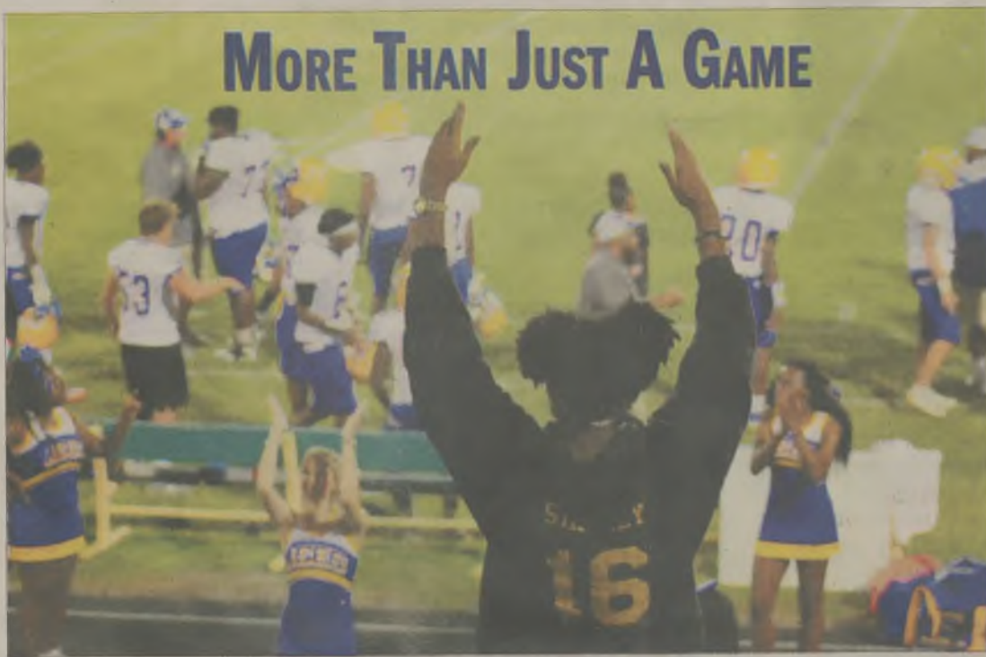
A fan celebrates a touchdown at a recent John A. Holmes High School varsity football game.