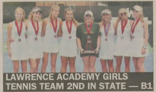
LAWRENCE ACADEMY GIRLS TENNIS TEAM 2ND IN STATE — B1