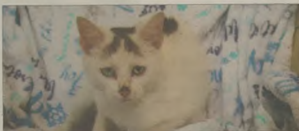
Sage is a quiet boy, who likes bring held.

The Tri-County Animal Shelter and Adoption Center is on Icaria Road in Tyner and can be reached by calling 252-221-9514.