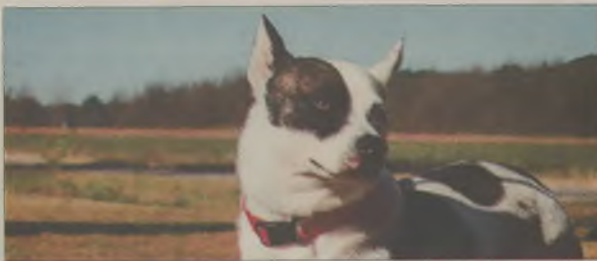
Otis is a low-rider who is housetrained. He is good with other dogs and kids.