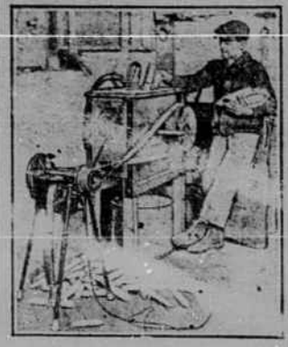
Power Stand Operating Corn Sheller

In an endeavor to solve, to some extent, the labor problem on American farms, the General Electric Company has brought out a unique, yet simple, apparatus known as a power stand. It enables a small, powerful motor to be transported from place to place about the farm, mounted on a tripod.