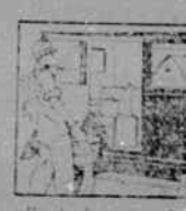
Seat adjust forward and back for tall and short people.