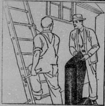
Neighbor—Nice-looking roofing. But how long will it wear? Farmer—Well—same stuff's been on my shed since I moved in here—and you know how long ago that was.

Barrett Roll Roofing gives years of weathertight service.