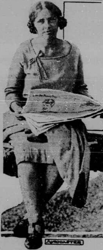
Failing in seven attempts, Mercedes Gleitz, London typist, finally swam the English channel on the eighth try, the first British woman ever to achieve the feat.